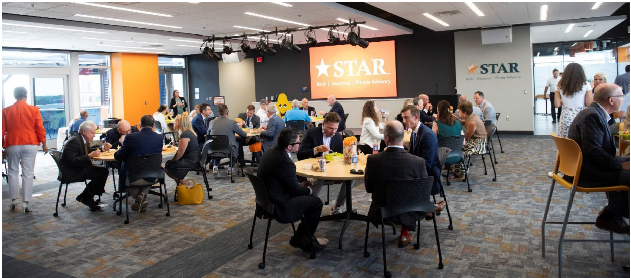
Guests of STAR Bank and dignitaries of Fort Wayne attended a reception in STAR's 7 th floor event space following the ribbon cutting of their new headquarters building on August 8.